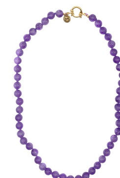
William Amethyst gemstone 28 | 69,95