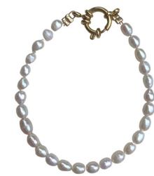
Boris Baroque pearls 16 | 39,95