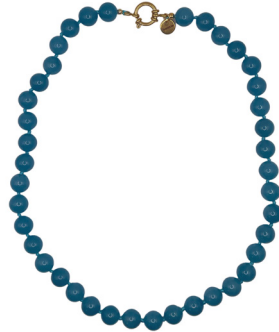
William blue Amethyst gemstone 28 | 69,95