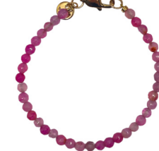
Roger pink Jade gemstone 20 | 49,95