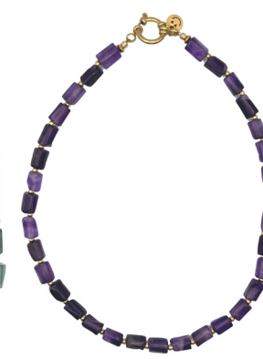
Phil purple Agaat gemstone 40 | 99,95