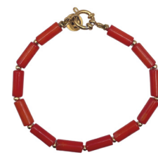
Tommy tube Coral 24 | 54,95