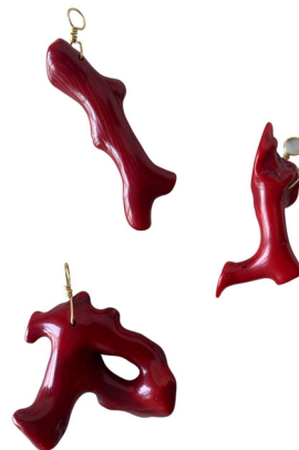
Phil coral Coral branch 14 | 39,95