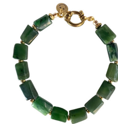
Phil green Agaat gemstone 30 | 74,95