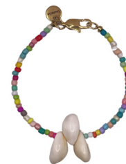
Woody shell mixed Bracelet Japanese beads 24 | 54,95