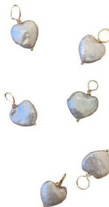
Woody heart Baroque pearl 10 | 24,95