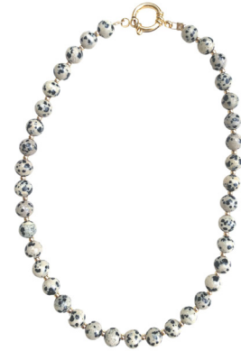
Fred dot Natural stone 32 | 79,95