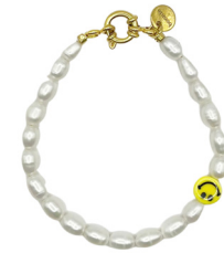
Boris smile Baroque pearls + Ceramic smiley 16 | 39,95