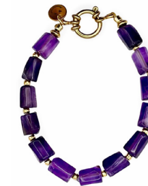
Phil purple Agaat gemstone 30 | 74,95