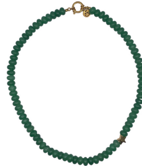
Fred star turquoise Amethyst gemstone 28 | 69,95