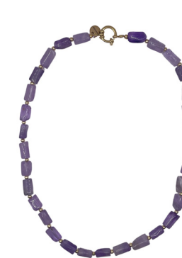
Phil lila Amethyst gemstone 40 | 99,95