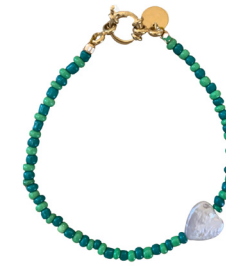
Woody Japanese beads 26 | 34,95