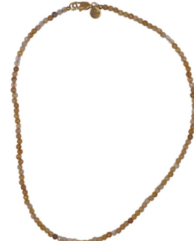
Roger yellow Jade gemstone 28 | 69,95