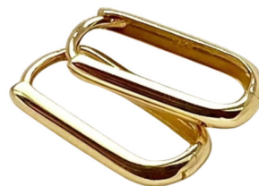
Long hoops Stainless steel 15 | 34,95