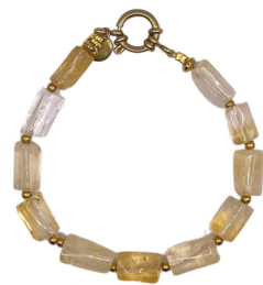
Phil gold Citrine stone 24 | 59,95