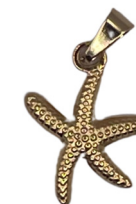
Seastar pendant Stainless steel 24 | 54,95