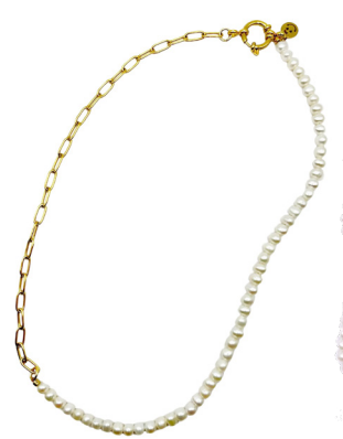
Flint gold Baroque pearls 28 | 69,95