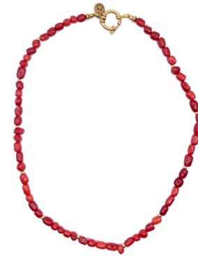
Tommy boy Coral 30 | 74,95