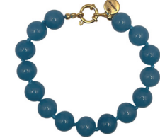
William blue Amethyst gemstone 20 | 49,95