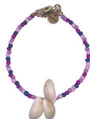
Woody shell lila Bracelet Japanese beads 24 | 54,95