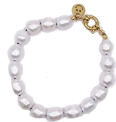
Math robe Baroque pearls 22 | 54,95