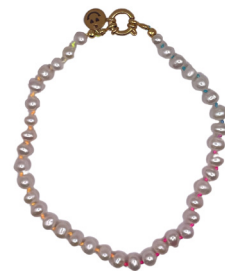
Boris summer robe Anklet Baroque pearls 24 | 54,95