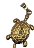
Turtle pendant Stainless steel 24 | 54,95