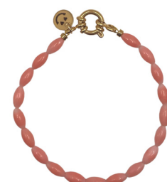
Tommy peach Coral 20 | 49,95