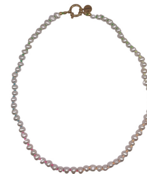
Boris summer robe Baroque pearls 24 | 54,95