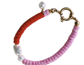
Robbie pink\red Howlite beads 16 | 39,95