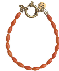
Tommy orange Coral 18 | 44,95