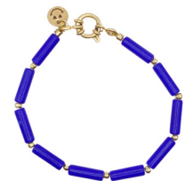
Mickey blue Synthetic beads 15 | 34,95