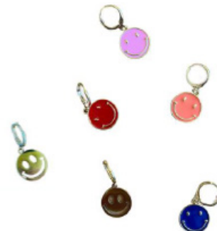
Smiley click Multiple colours Stainless steel 8 | 19,95