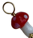
Johnny champ Ceramic 10 | 24,95