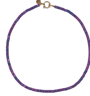
Luc blue\purple Howlite beads 20 | 49,95