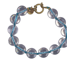
William big Crystal 30 | 74,95