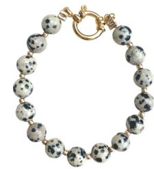
Fred dot Natural stone 15 | 34,95