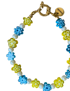
Denzel Millefiori beads 18 | 39,95