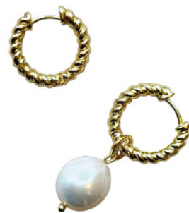
Twisted hoops 20mm Stainless steel 12 | 29,95