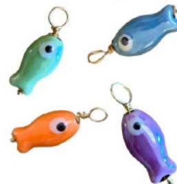
Happy fish Multiple colours Ceramic 10 | 24,95