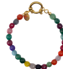
Roger Jade gemstone 20 | 49,95