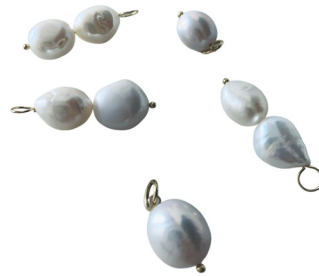
Math double Baroque pearl 12 | 29,95