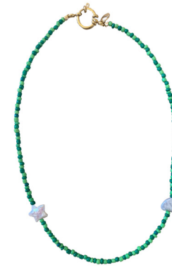
Woody Japanese beads 20 | 49,95