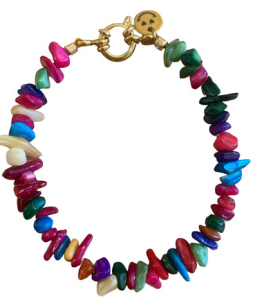
Luc summer Shells 16 | 34,95