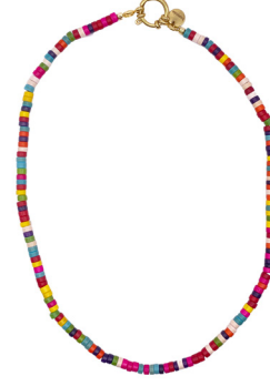
Luc mix Howlite beads 18 | 44,95