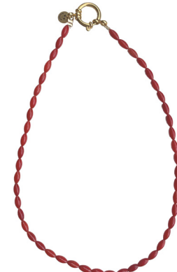
Tommy red Coral 28 | 69,95