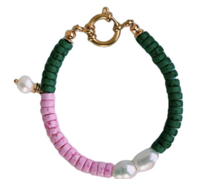
Robbie pink/green Howlite beads 16 | 39,95