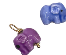
Elephant pendant Purple and blue Ceramic 10 | 24,95