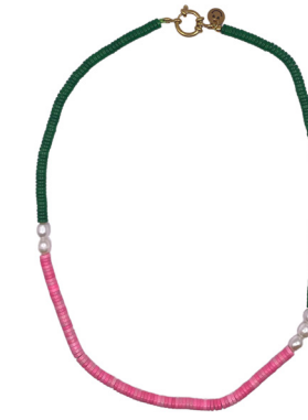
Robbie pink/green Howlite beads 22 | 54,95