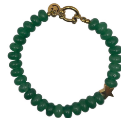
Fred star turquoise Amethyst gemstone 20 | 49,95