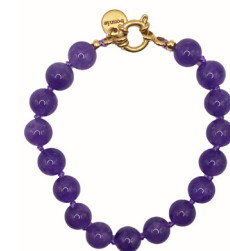
William Amethyst gemstone 20 | 49,95