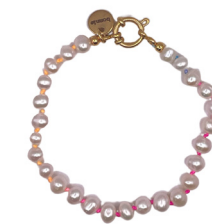
Boris summer robe Baroque pearls 16 | 39,95