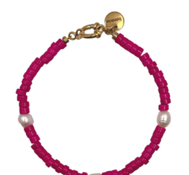
Luc pearl Howlite beads 16 | 39,95