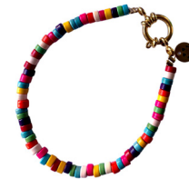
Luc mix Howlite beads 15 | 34,95