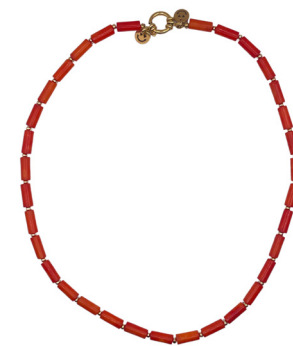
Tommy tube Coral 32 | 79,95