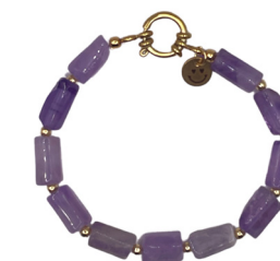
Phil lila Amethyst gemstone 30 | 74,95