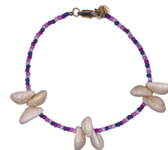
Woody shell lila Anklet Japanese beads 24 | 54,95