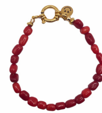
Tommy boy Coral 18 | 44,95