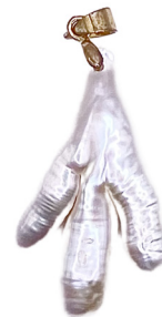
Math feed Baroque pearl 14 | 39,95