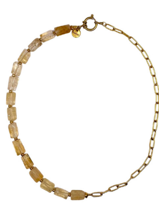
Phil gold Citrine stone 32 | 79,95