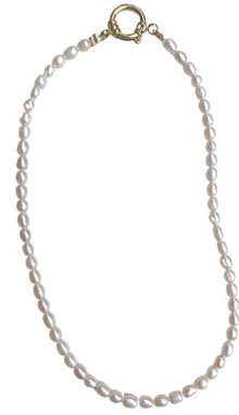
Boris Baroque pearls 20 | 49,95