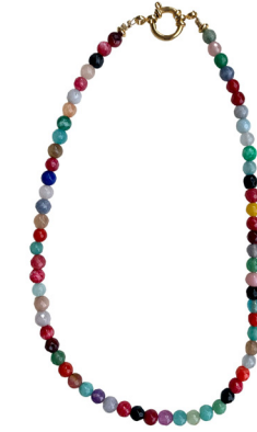
Roger Jade gemstone 30 | 74,95