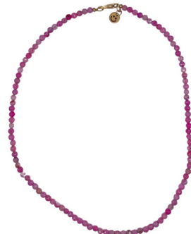
Roger pink Jade gemstone 28 | 69,95