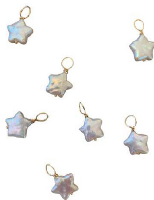
Woody star Baroque pearl 10 | 24,95