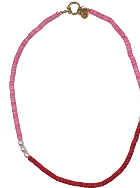
Robbie pink/red Howlite beads 22 | 54,95