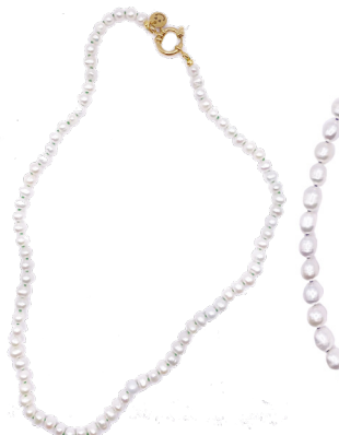
Oliver robe Baroque pearls 28 | 69,95