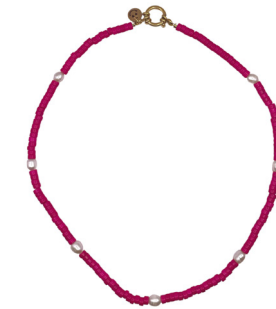
Luc pearl Howlite beads 20 | 49,95