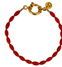
Tommy red Coral 18 | 44,95