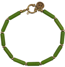
Mickey lime Synthetic beads 15 | 34,95