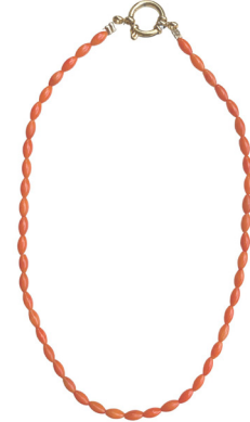
Tommy orange Coral 28 | 69,95