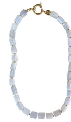
Phil ice blue Agaat gemstone 40 | 99,95