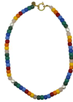
Q Ceramic beads 18 | 44,95