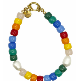
Q Ceramic beads 16 | 35,95