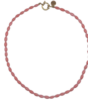
Tommy peach Coral 28 | 69,95