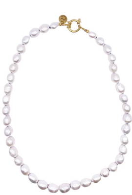
Math robe Baroque pearls 30 | 74,95