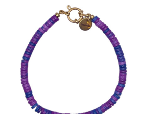
Luc blue/purple Howlite beads 16 | 39,95