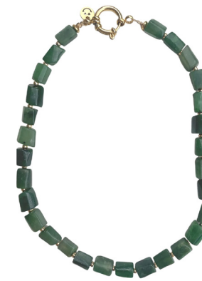
Phil green Agaat gemstone 40 | 99,95