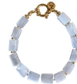
Phil ice blue Agaat gemstone 30 | 74,95