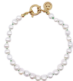
Oliver robe Baroque pearls 15 | 34,95