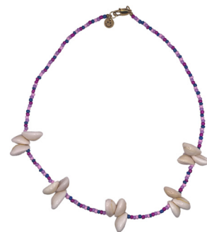
Woody shell lila Necklace Japanese beads 24 | 54,95