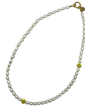
Boris smile Baroque pearls + Ceramic smiley 20 | 49,95