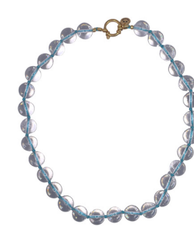
William big Crystal 40 | 99,95