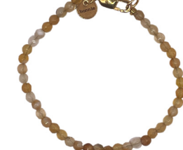
Roger yellow Jade gemstone 20 | 49,95