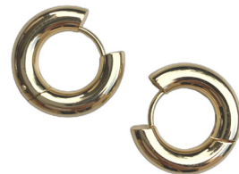
Chunky creoles 20mm Stainless steel 12 | 29,95