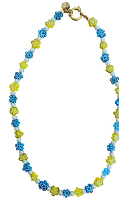
Denzel Millefiori beads 24 | 49,95