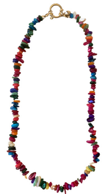
Luc summer Shells 20 | 49,95