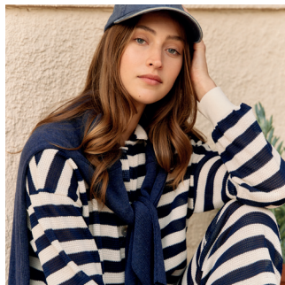
PAMPEROS PALIS INSPIRE KONA