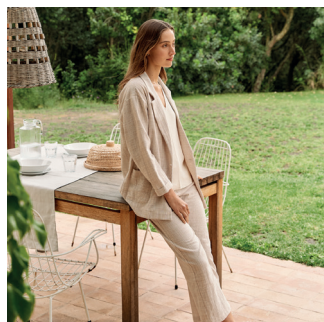
COKEYE JALOQUE BELAT WESTERLIES